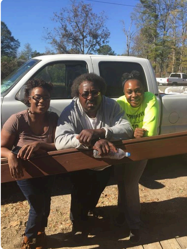
We Love You Daddy